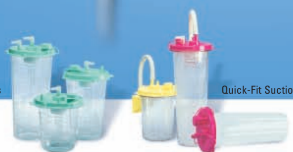
Quick-Fit Suction Liners