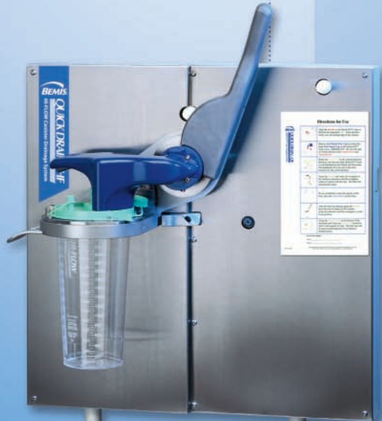
Hi-Flow Rigid Canisters

Built-in rinse feature allows the option of spraying water into the liner or canister to clean out any remaining waste.