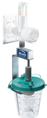
800cc Hi-Flow SOLO #534110 / 8002 055