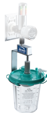
1200cc Hi-Flow #534310 / 484410